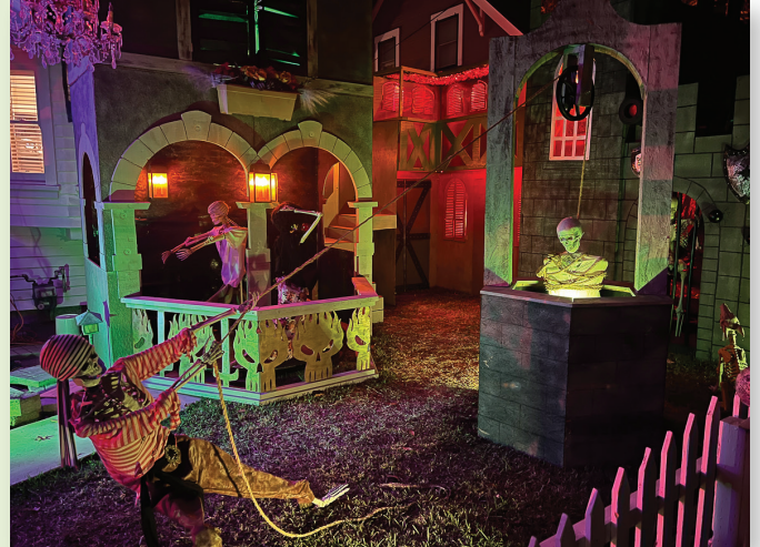
2023 Best Theme Winner, 314 East Maple

Spook up your home or business in the Historic District for Halloween fun. The Judges will decide the best in categories of Creepy Street, Orange & Black, Horror House and Spirit of Old Towne. (categories subject to change)