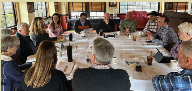
OTPA Board at its 2024 Planning Retreat.

Old Towne loves to decorate for the holidays, and OTPA loves to recognize the best in categories of Most Beautiful, Most Old Fashioned, Best Use of Lights, Most Original, Most Whimsical, Best Block, Most Festive (Commercial), and Honorable Mention. (categories subject to change)