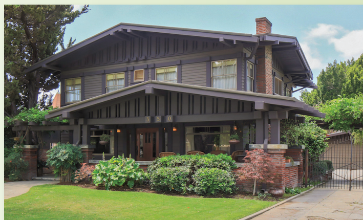
This Craftsman mansion is on this year's home tour.

If you'd like to serve as a tour docent or other volunteer, go to otpa.org , click on the home tour volunteer tab (link live after 9/5/17).