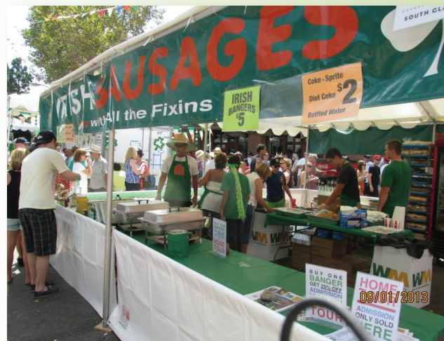
Irish bangers are street fair goers very favorite!

We'll again host the very popular Irish Street Banger Food Booth. Revenue from OTPA food sales is one of our major sources of income, so thank you for your financial support. Our Irish Bangers are among the most popular items at the Fair. Or try Irish Nachos and French Fries with a topping of cheese sauce and bacon. If you'd like to volunteer, go to www.OTPA.org and look for Click to Volunteer.